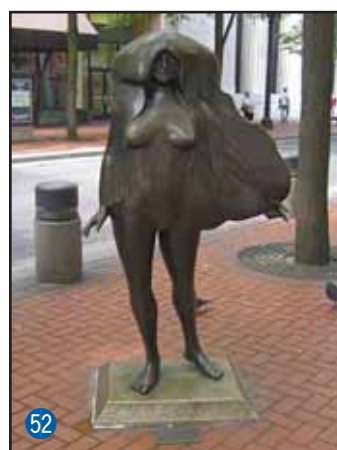
KVINNEAKT (NUDE WOMAN), NORMAN TAYLOR, 1975