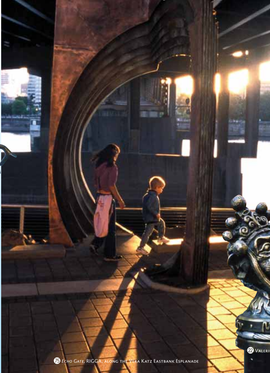
75 ECHO GATE, RIGGA, ALONG THE VERA KATZ EASTBANK ESPLANADE