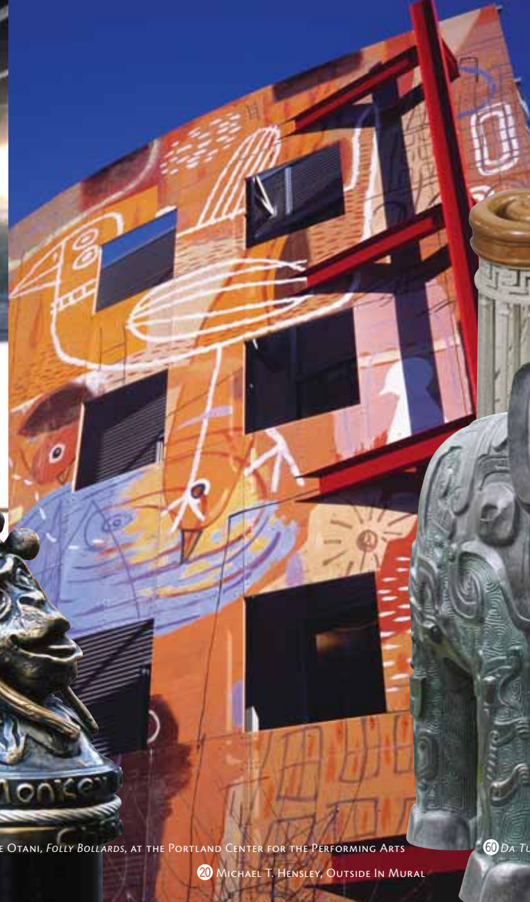
22 VALERIE OTANI, FOLLY BOLLARDS, AT THE PORTLAND CENTER FOR THE PERFORMING ARTS