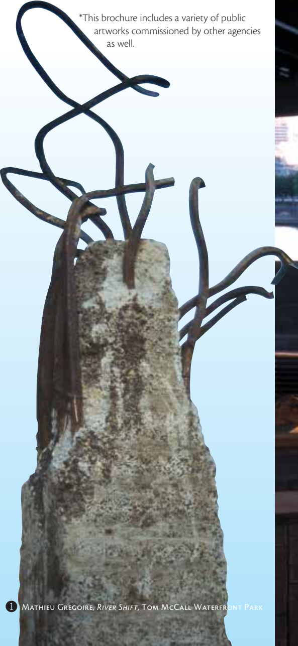
1 MATHIEU GREGOIRE, RIVER SHIFT, TOM MCCALL WATERFRONT PARK