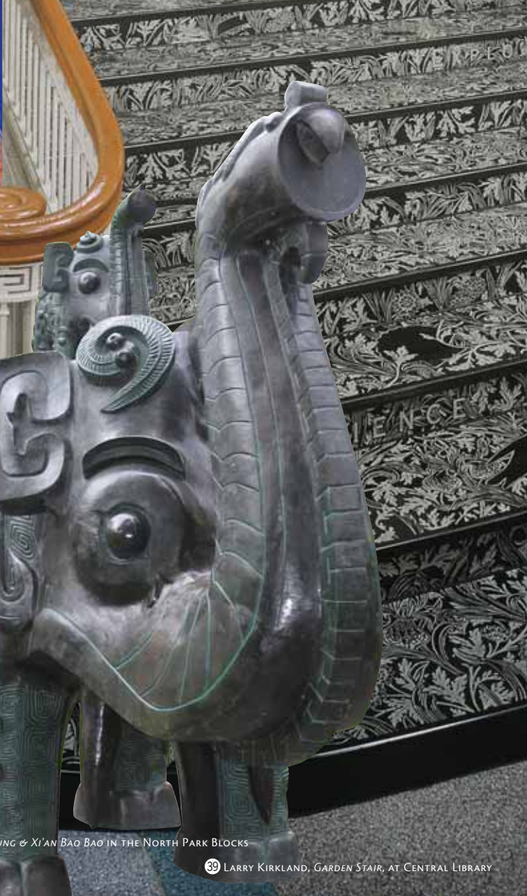
60 DA TUNG & XI'AN BAO BAO IN THE NORTH PARK BLOCKS